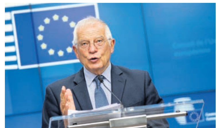
European Union foreign policy chief Josep Borrell speaks during a media conference after a meeting of EU foreign ministers by videoconference at the European Council building in Brussels on Monday, June 15, 2020.

German Foreign Minister Heiko Maas also insisted on the need "to revive the peace process in the region and find a way for both sides to speak and negotiate with each other." "A multilateral format could certainly be the right framework for this, and we are prepared to support any initiative in this direction — and I would be glad if our colleague from Wash-